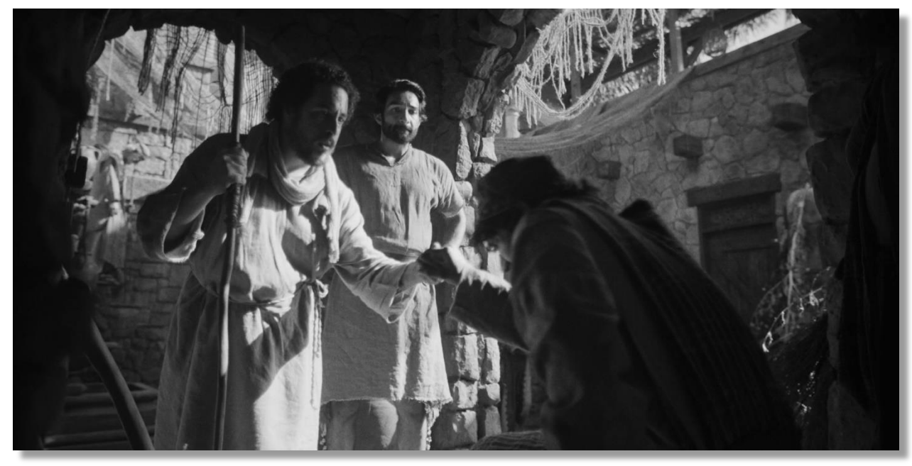
You can watch this episode via The Chosen app on your smartphone or tablet, or via your web browser on the chosen.tv here.